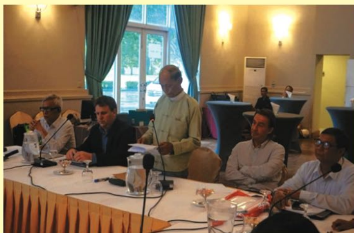
Figure 2 Chairman announced the commitment to partnerships

The half-day coordination meeting was attended by a range of stakeholders, including the Forest Department, Myanma Timber Enterprise and Department of Research and Innovation, FAO, FLEGT VPA advisors, international and national NGOs, certification bodies and the private sector.