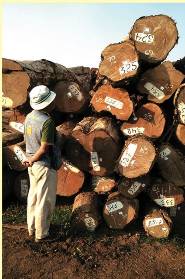
Figure 23 Random checking the logs against the log list measurements as required by MTLAS