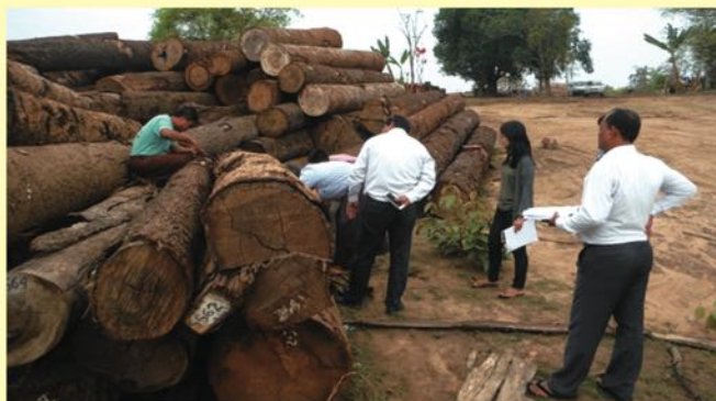
Figure 19 Random checking the log at Thet- Kal-Chin Agency Depot