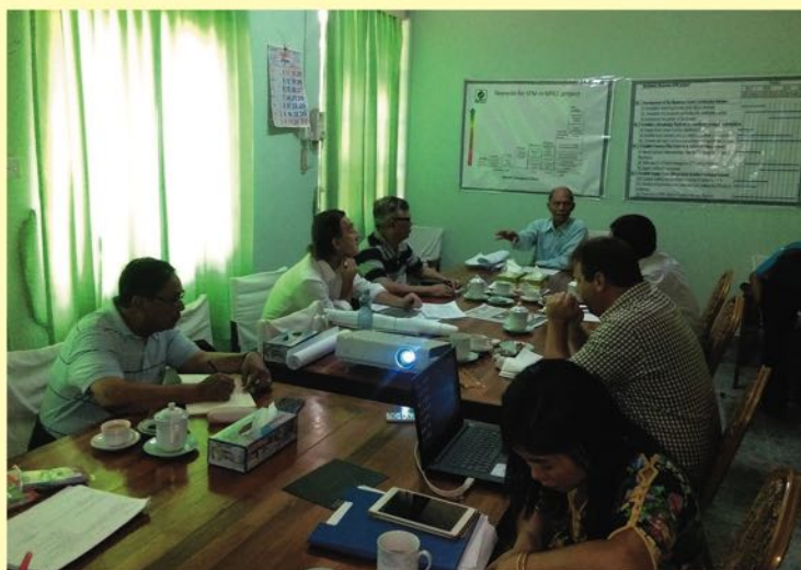
Figure 15 General Discussion about the system documentation and coding system