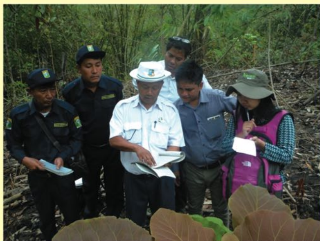
Figure 21 Manager (Kawlin Extraction Agency) explained the extraction procedures