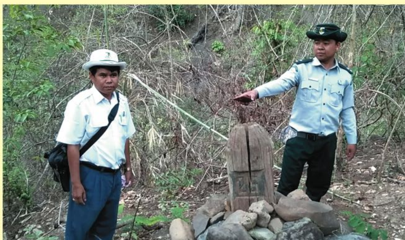
Figure 24 The representatives staffs of FD and MTE explained the forest boundary demarcation of this permeant reserved forest. This was an Corrective Action in the participatory assessment that has now been addressed.