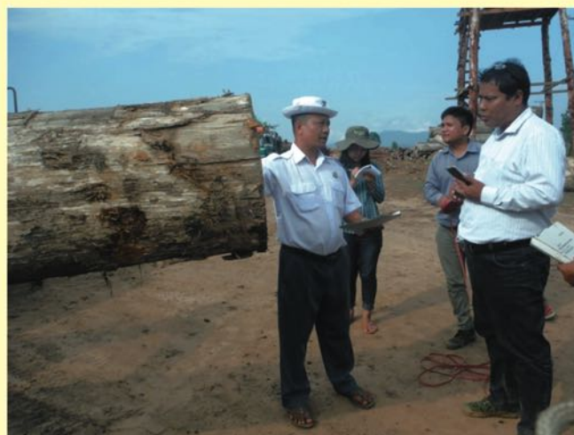
Figure 22 Manager( Kawlin Extraction Agency) explained the marks on the logs and how to check them.