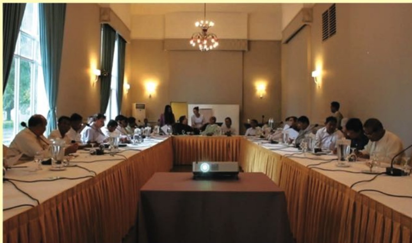
Figure 5 Partners discussed important issues such as the feedback from EU-Brussels meeting and the need for CF to be further considered

In its first year, the project has helped to strengthen the MFCC secretariat, field test Myanmar's timber legality assurance system (MTLAS) and establish cooperation between EU buyers and Myanmar wood industries. Project partners also helped to the national system documentation and conducted auditor training.