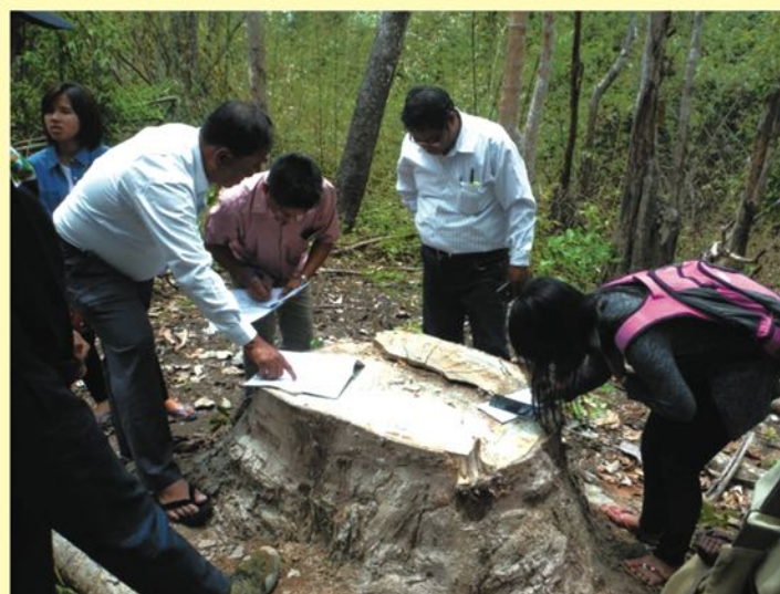
Figure 20 Checking the stump at West Katha Extraction Agency