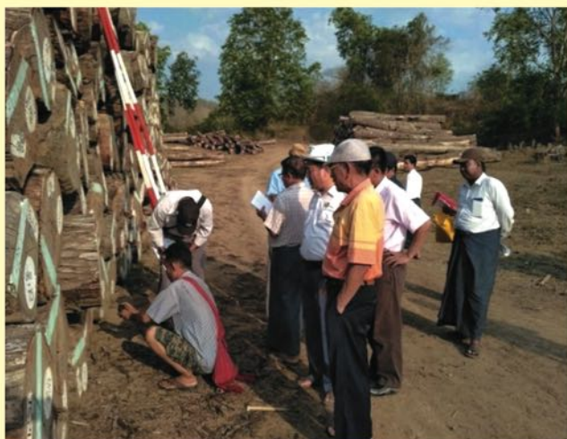
Figure 25 Nature watch conducted to verify random sampling the logs to ensure segregation is possible with each log clearly marked by the revenue number.

ii. Gangaw Extraction Agency, KunZe Reserved Forest, Compartment no. 65 and Long Hton Reserved Forest, Compartment no. 18