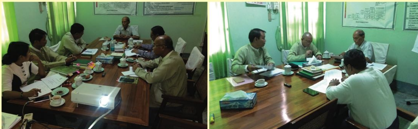
Figure 18 Finalize MTLAS Audit Form with the coordination with MFCC, FD and MTE