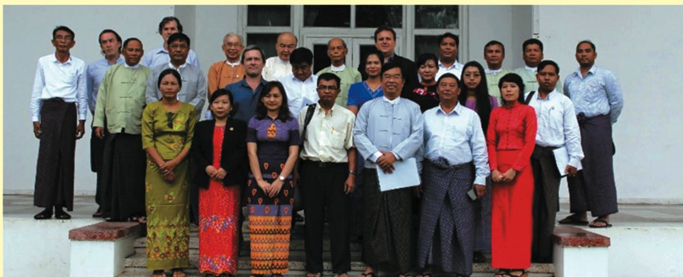
Figure 4 Project partners from MTE, FD, FLEGT, FFI, RECOFTC stand in the group photo after the project coordination meeting

One year on, and MFCC as it reforms its forest sector is gathering pace. This was clear last month, as the Myanmar Forest Certification Committee (MFCC) held its first annual multi-stakeholder coordination meeting.