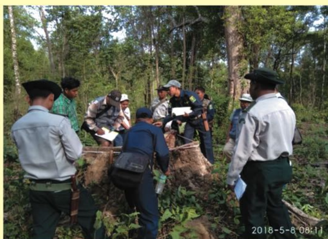
Figure 26 Nature watch conducted to check the marks on the stump to ensure they are consistent with the FD and MTE contract